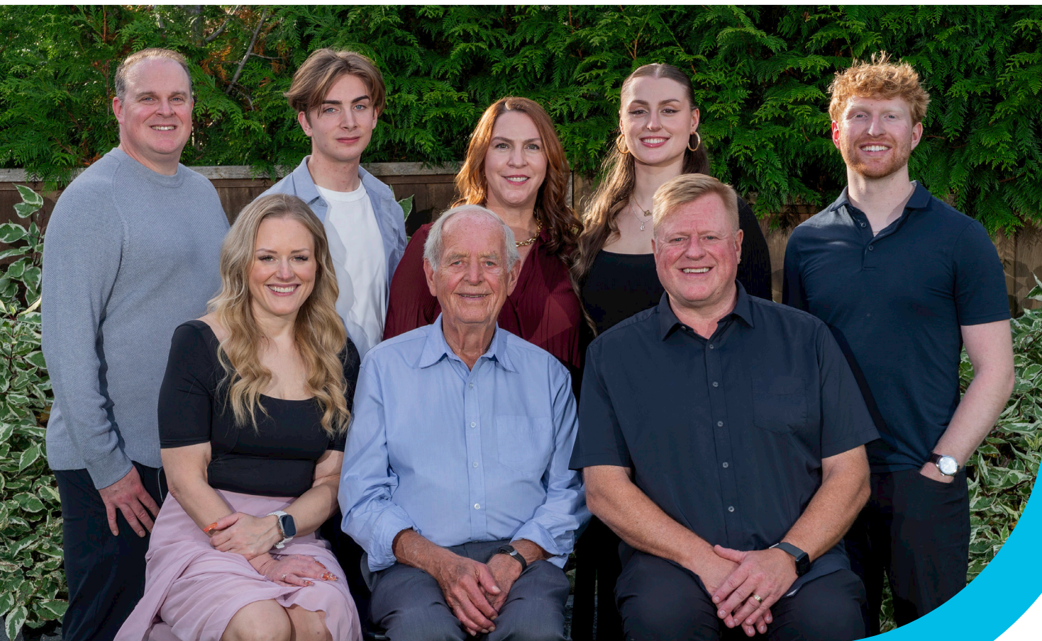
The Cowell Family